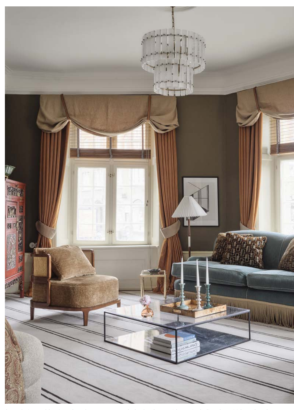
Several pieces of furniture have been custom made for Sanders Residence, including the British-made sofa, envisioned as a colourful sitting room centrepiece and brought to life in an understated retro look with bullion fringe and bespoke patterned cushions for contrast. The rattan armchairs with soft cushions are also custom made, while the table is from local Copenhagen shop and café Beau Marché. The curtains are made from soft, orange corduroy draped with linen at the top. The wooden blinds add a further layer to the windows, dressing the interiors in a colonial-inspired mood. A striped carpet from Ege Tæpper adorns the floor. The graphic black and white Frame poster is from PlakatCPH.